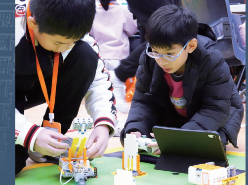
首屆 MatataWorld 機械人挑戰賽中港交流賽