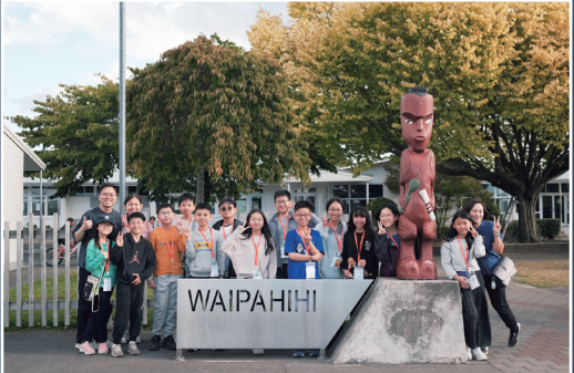
New Zealand Cultural Tour