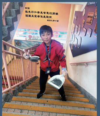
認識中華文化,於農曆新年前 舉行掃掃抹抹迎新春活動, 學會承擔及自理精神