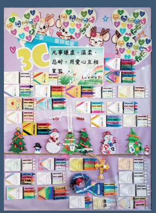
正向校園氛圍: 課室壁報展示生命成長課 作品,提升歸屬感