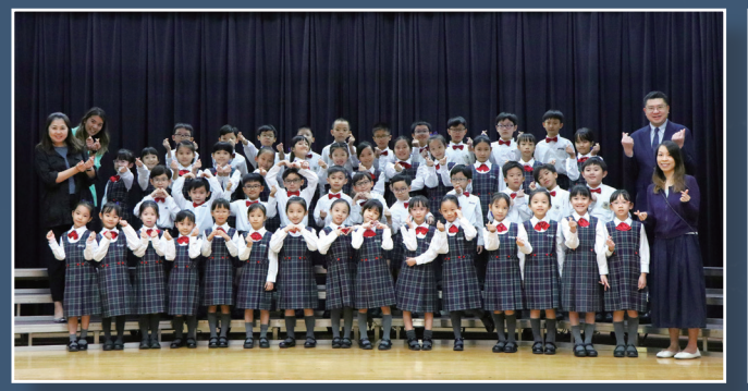
Choral speaking team

Finally, our Drama, Communications and Literacy (DCL) curriculum for primary four to six students is designed to cultivate well-rounded individuals by integrating essential literacy skills with real-world applications. We hope to equip students with the necessary tools to excel academically and communicate effectively in various contexts, preparing them for success in the modern world. That's why we also hold a cultural tour every year in English speaking countries for senior students.